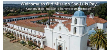
Welcome to Old Mission San Luis Rey Auspitry of the Franciscan Friars Province of Santa Barbara

Fri, Sat & Sun, March 31 - April 2, 2023.